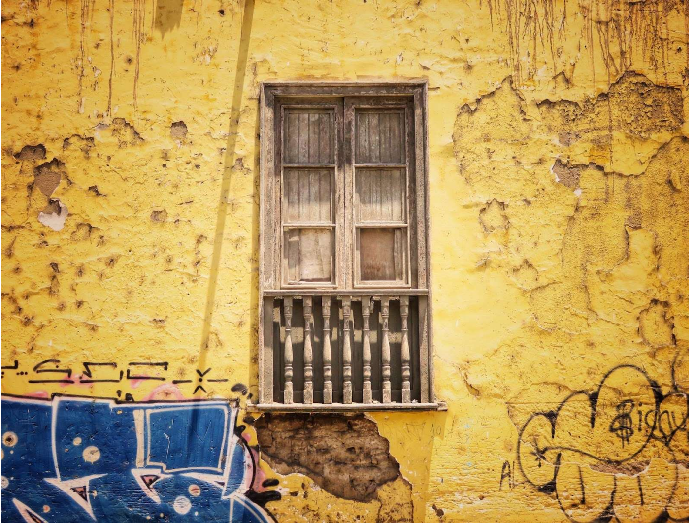
Adela Hurtado, El Balcon, 2018